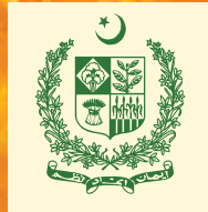
ANIMAL QUARANTINE DEPARTMENT