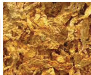
THRESHED STRIPS TOBACCO