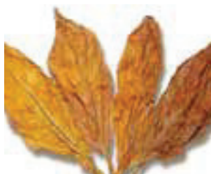
FLUE CURED VIRGINIA TOBACCO