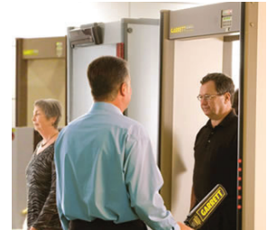
Walk Through Gates