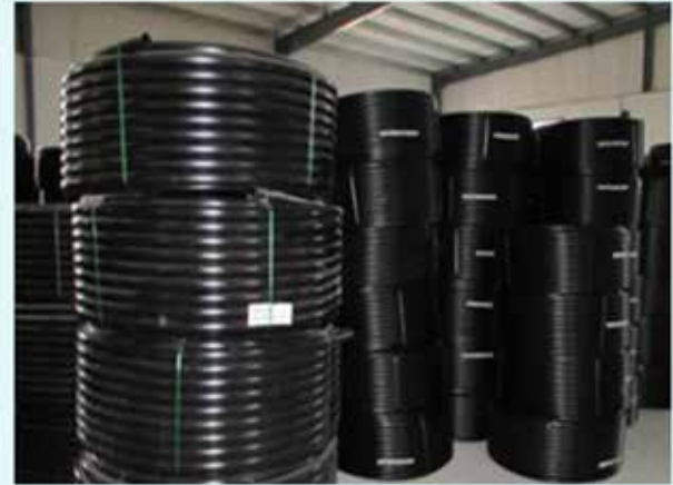
Industrial Pipes, Fittings and Tanks