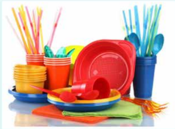
Kitchenware and Household Articles