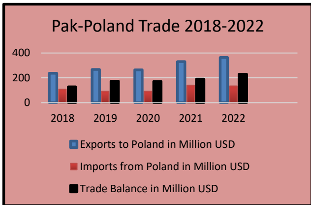
Pakistan Exports to Poland In 2022 (364 Million USD)