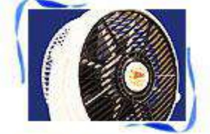
Louvre Bracket Fan