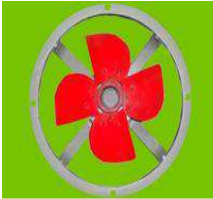
Deluxe Model (Round Metal Body)