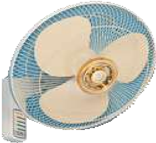
Bracket Fan Light