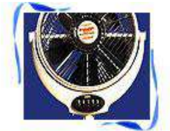
Louvre Pedestal Fans