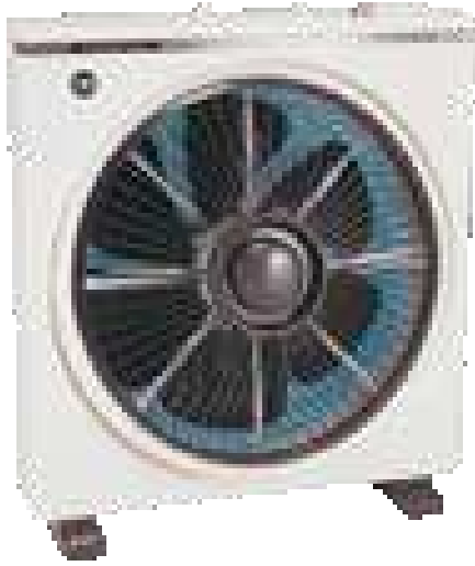
Tilting Box Louvre Fan