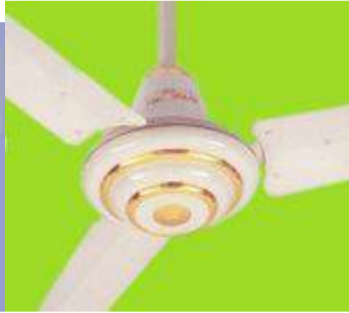
Ceiling Fan SM-RR Model 102