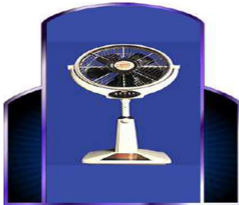
Louvre Pedestal / Table Fan